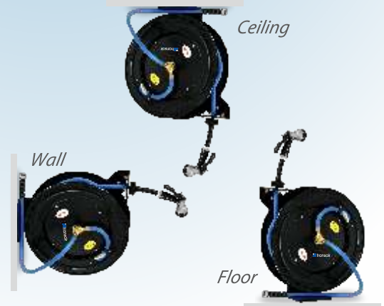
Multiple Mounting Options Ceiling, Wall & Floor