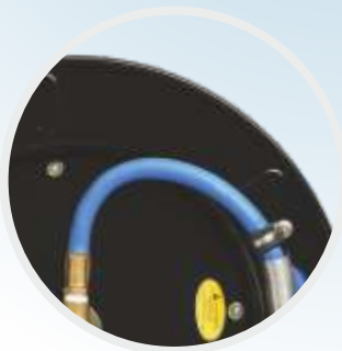
Powder Coated Steel Construction