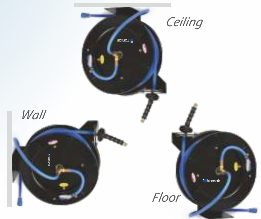
Multiple Mounting Options Ceiling, Wall & Floor